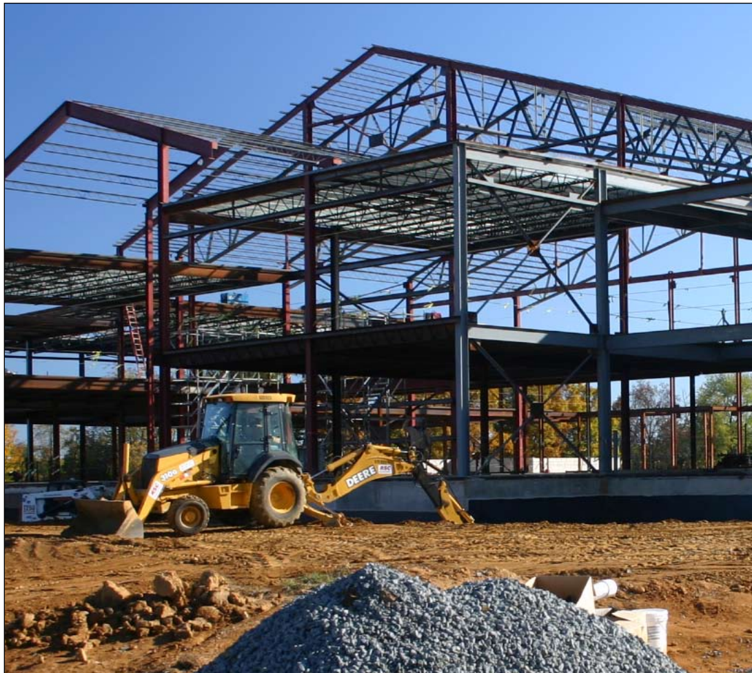
The Barbara Hodel Center, under construction at Patrick Henry College.

For more information please contact the development office at 540-338-8729 or visit our web site at www.phc.edu